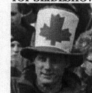
The Week in Pictures Jan23-29

ANNOUNCEMENTS: Obituaries | Births | Cards | InMemoriams | Milestones